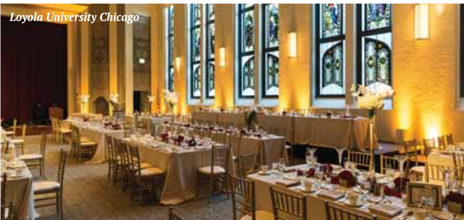
Loyola University Chicago